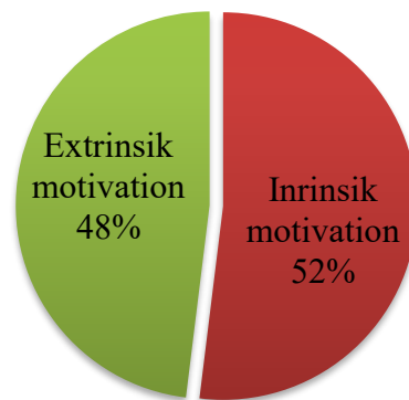
Figure 2. Comparison Between Intrinsic and Extrinsic Motivation

Based on the results of the questionnaire obtained and analyzed regarding dominant motivation, both intrinsic and extrinsic, the results are shown in the pie chart below (figure 2). Based on the pie chart below, intrinsic motivation scores higher than extrinsic motivation. Namely 4.26 (52%), while extrinsic motivation has an average score of 3.94 (48%). Although there are different scores between intrinsic and extrinsic motivation, both strongly interpret motivation based on the Likert Five-Point range scale. It can be concluded that language lab students, especially third-semester students more dominant intrinsic motivation. These results can answer the second research question of this study.